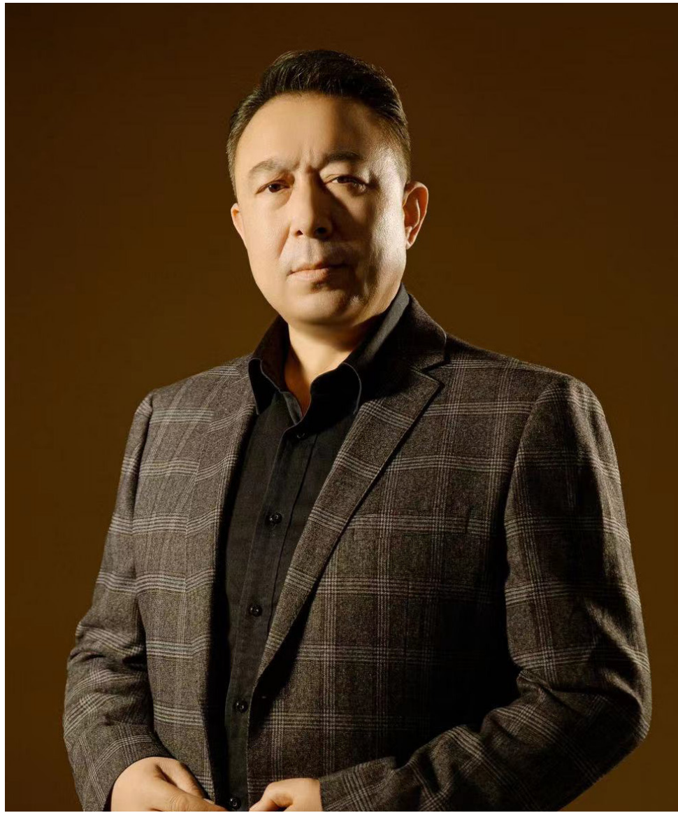
Embassy of the People's Republic of China in the Kingdom of Bahrain